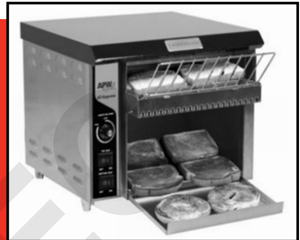
AT EXPRESS RADIANT CONVEYOR TOASTER