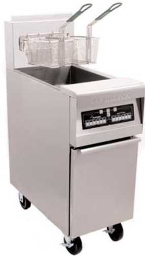
Shown with optional computer and casters