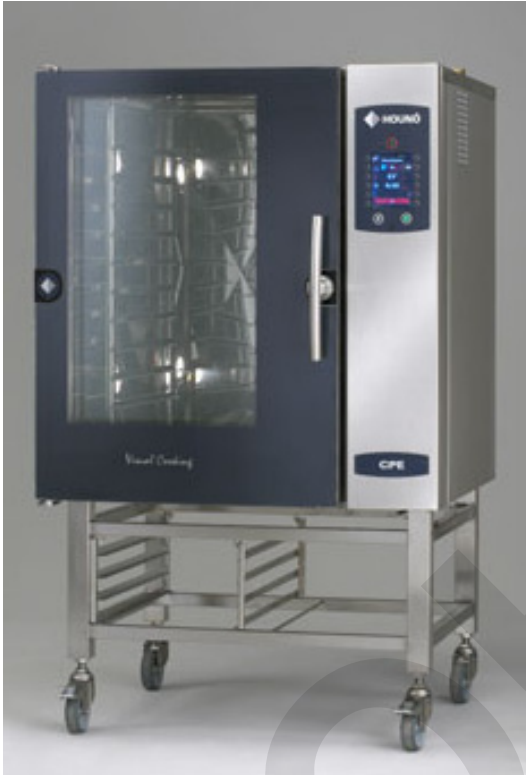
BKI's CPE 1.10 shown with optional stand