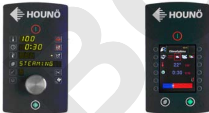
C (Left) and CPE (right) Control Panel

Now you can steam, roast, bake, reheat, and proof products with just one unit. BKI's C and CPE 1.10 Combi-Oven features an integrated system of circulating hot air with injection steam features to ensure optimal cooking conditions for cooking over a full menu spectrum. The result is perfectly prepared foods, ranging from beef and fish to vegetables and rice and baked goods. Intelligent options such as the Simple Control Panel and the self-cleaning unit make the C and CPE 1.10 easy to use and maintain.